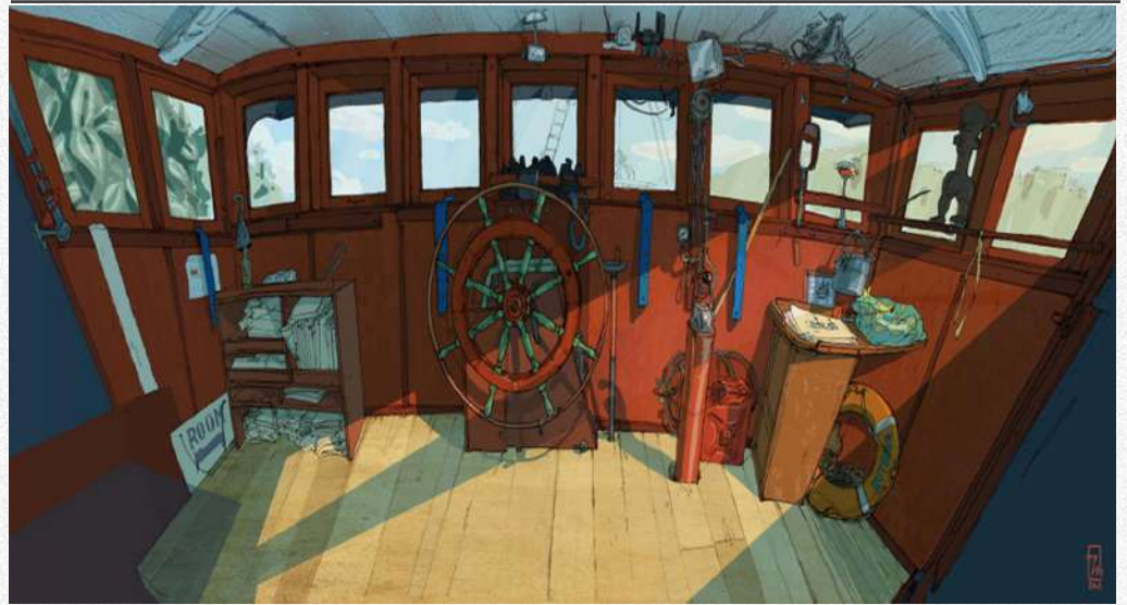
The wheelhouse, installed second hand in 1963 Drawing Elza Monlahuc.

The ship is a typical 1916 riveted fishing craft destined for the catching of herring with drifting nets. On deck stood only two masts and the steering wheel. In 1929 she was fitted with an engine and appeared a small steering cabin on deck.