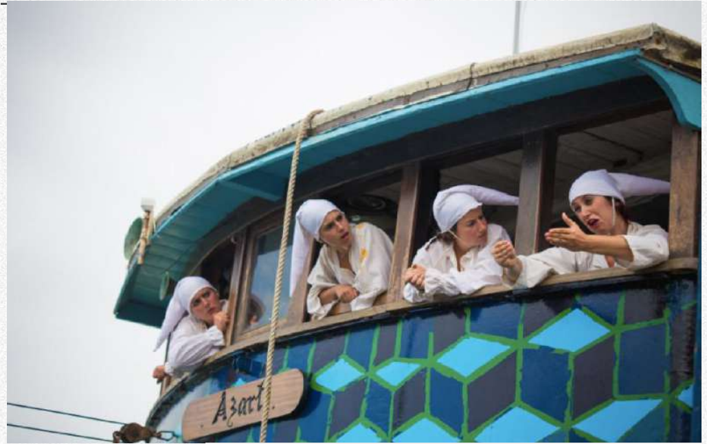
Show Peer Gynt during SAIL, NDSM Amsterdam., August 2015

The project owes its existence and survival to the selfless dedication of countless artists whose collaboration lasted from one evening to ten years or more. Generally, guest artists participate for one season that takes about six months, including preparations.