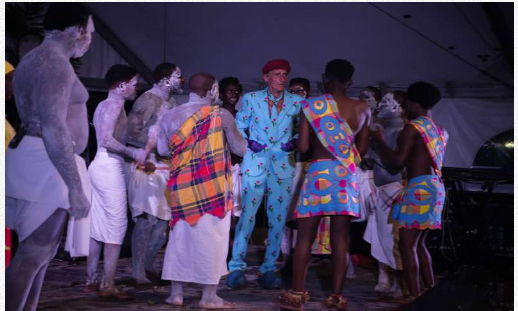
Show Maroon Heritage, Paramaribo, April 2018

The show 2018-2019 is a musical theater about the common heritage of Suriname and the Caribbean: an Indian culture mixed with immigrants from African, Indian and Chinese origin who have freed themselves from slavery and colonialism.