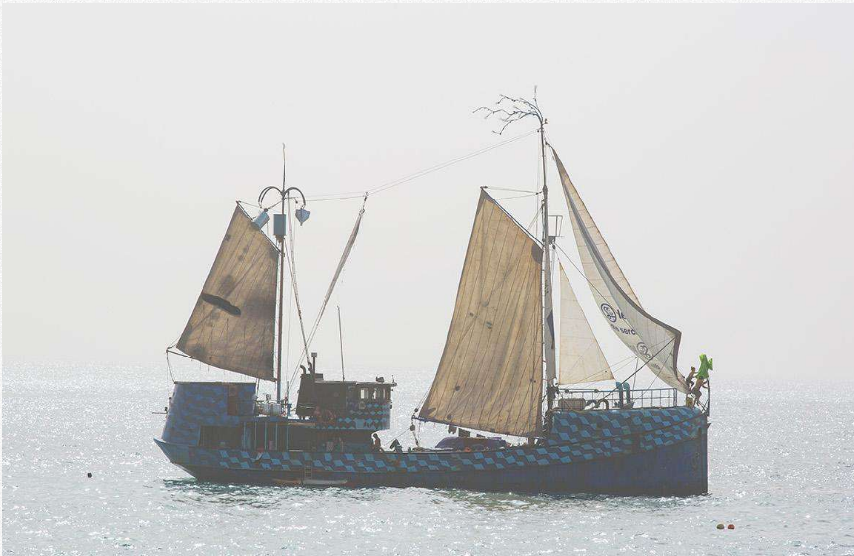
Azart La Nef des Fous navigue de Cabo Verde au Surinam, Janvier 2018