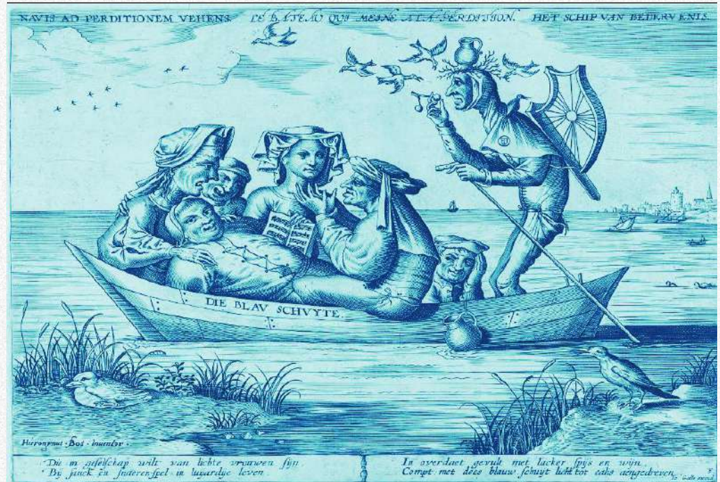
"Die Blau Schuyte" (The Blue Barge) Pieter van der Heyden, 1559. Hieronymus Bos inventor. Rijksmuseum, Amsterdam

The medieval tradition of flamboyant popular laughter is a unique phenomenon that provoked a 'carnivalisation' of western worldview.