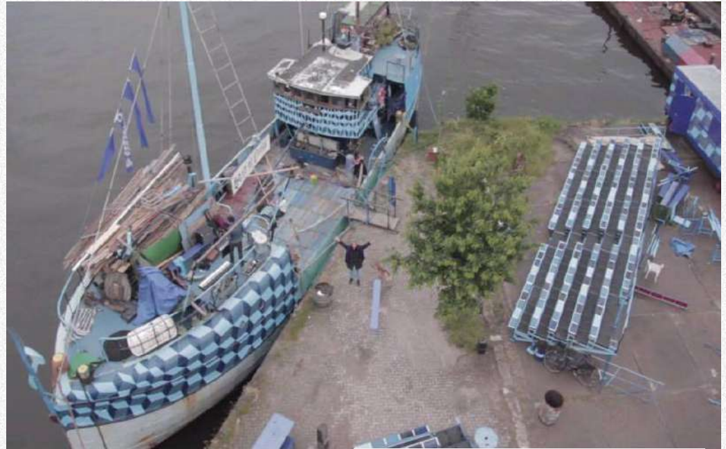
Festival of Fools, Amsterdam NDSM, Juli 2015

The Festival of Fools is an itinerant small-scale arts festival that focuses on the personal involvement of an audience of all cultures and ages and on a cross-cultural exchange between local and foreign guest artists.