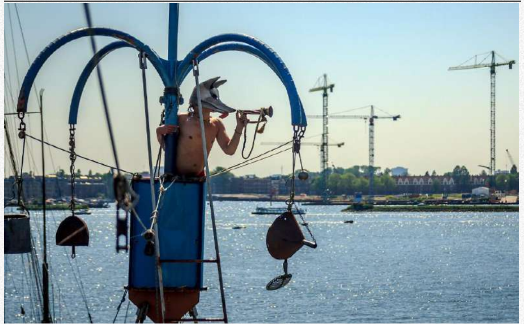
Amsterdam NDSM. Homeport 2015-2017

A stay of up to three weeks concentrated around a weekend of cultural activities.